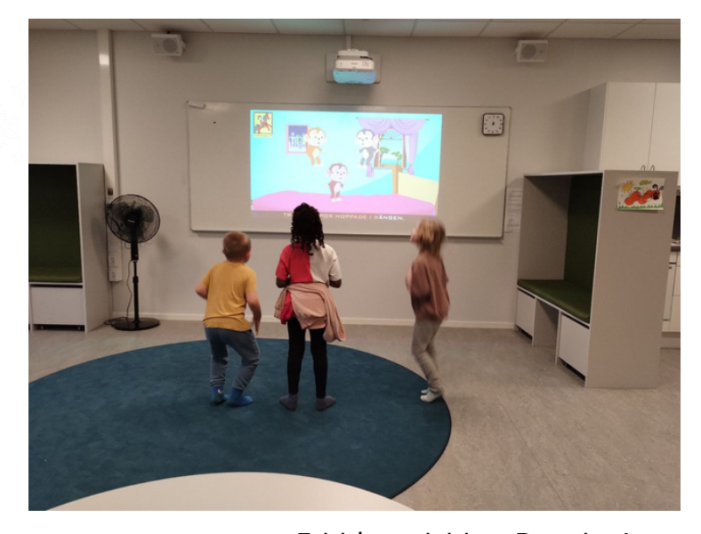
Fritids activities: Dancing!