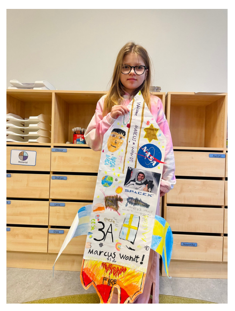
Year 3 student with her class space rocket!

The students were writing their own astronaut logs about their potential destinations for space exploration, whether it be the Moon, Mars, or any of the stars within our solar system. There is a saying "Dream big; if you don't reach the stars, you might reach the Moon,", the mentors encouraged these young minds to nurture ambitious dreams. In doing so, she fostered a sense of curiosity and imagination among her students.