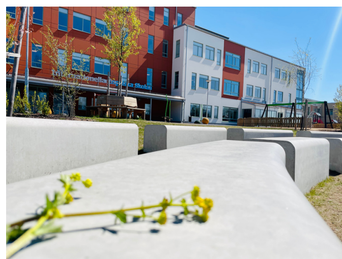
The rear of the school on a sunny day.