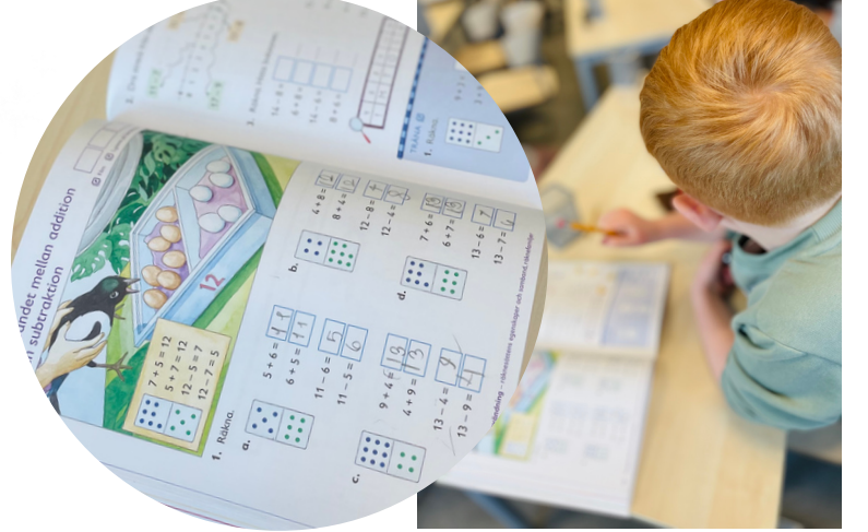
Year 1 student was revising his Maths lesson.