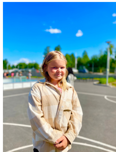
Recess fun time in the sun!