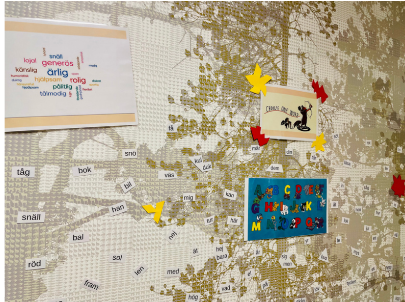
How we learn and share in 1B.